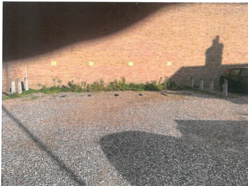
Car park spaces